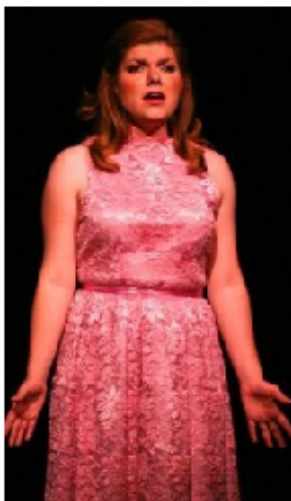
Kicking off Glaser Center's 10-year anniversary celebration

$50 dinner + show A delicious chicken and polenta dinner created by Worth Our Weight, with dessert & coffee $25 show only (8:00 p.m.) (dessert & coffee)